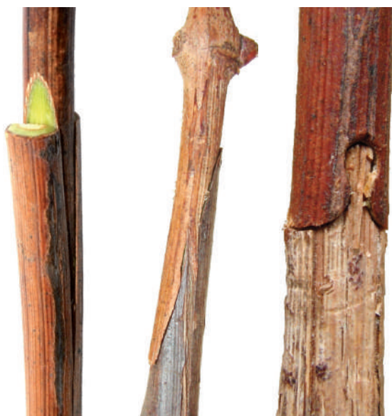
a. Full cleft graft b. Whip-and-tongue graft c. Omega graft

contamination have frequently been observed by researchers along the breeding process in nurseries (hydration, disbudding, callusing, rooting, etc.) 3 . As full cleft grafts are made directly on the rootstocks in the field, these vines are not subject to these “hostile environment” manipulations, giving them a better chance to remain healthy.