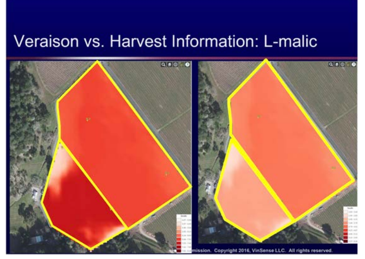
Figure 2: Grape Berry Malic Acid Concentration at Veraison (Left) vs. Harvest (Right) at Tres Sabores Vineyard in 2016. The right-most block in each image is cabernet and the left is Zinfandel. Notice the more uniform malic acid readings at harvest after canopy management practices based on precise deep soil moisture information was utilized.