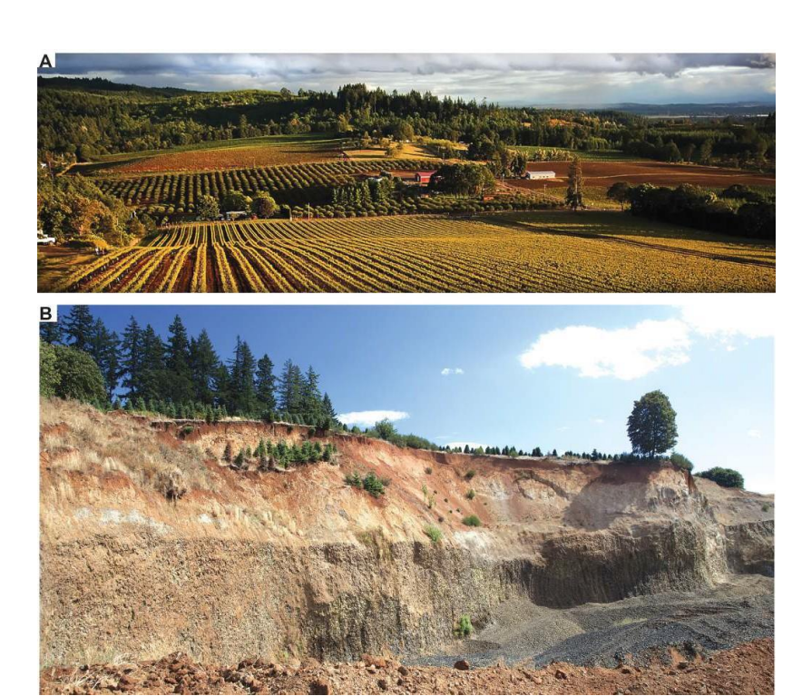
Figure 2: Red Jory Ultisol of Willamette Estate Vineyards in the south Salem Hills, Oregon, USA, where it is developed atop a thick middle-Miocene Oxisol (lateritic bauxite), red in the vineyards (A), and thick in a nearby quarry (B). The Jory soil series is intensely planted in vines, but comes in two distinct varieties parented by bauxite or by basalt.