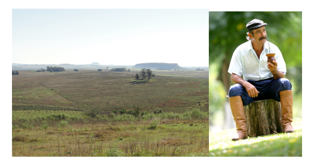
Figure 1. Campanha's landscape (a) and the gaucho (b).

The figure below (1-a) shows a typical landscape of the Campanha and the Pampa biome, with the presence of fields and hills in the background. Beside, figure 1-b shows the image of the gaucho.