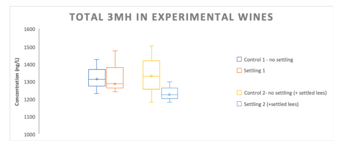
Figure 3: Total 3MH measured in Floreal experimental wines (laboratory scale vinification 1 L, triplicate for each trial) obtained by different pre-fermentative protocols: With or without cold settling (Statistics: one-way ANOVA then by Tukey HSD multiple comparison (p < 0.05). The symbol * indicate significant differences between the means at p < 0.05.).

Cold pre-fermentative treatments of grape juice are well known by winemakers to enhance varietal thiol levels in wine. In our study, experimental wines obtained from cold settled juices have similar 3MH levels (p > 0.05; F-Test) than control ones (Figure 3). This is the opposite tendency to those normally observed and raises the question of the validity of this enological practice for the vinification management of the new varieties.