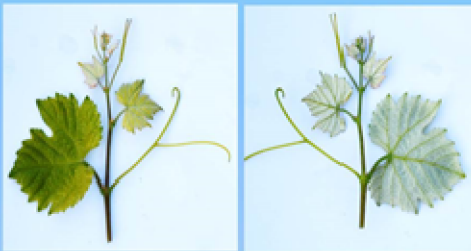
Fig.1 Young shoot of the variety "Nektar"

Keywords: Hybridization, variety, leaves, inflorescence, berry, seed.