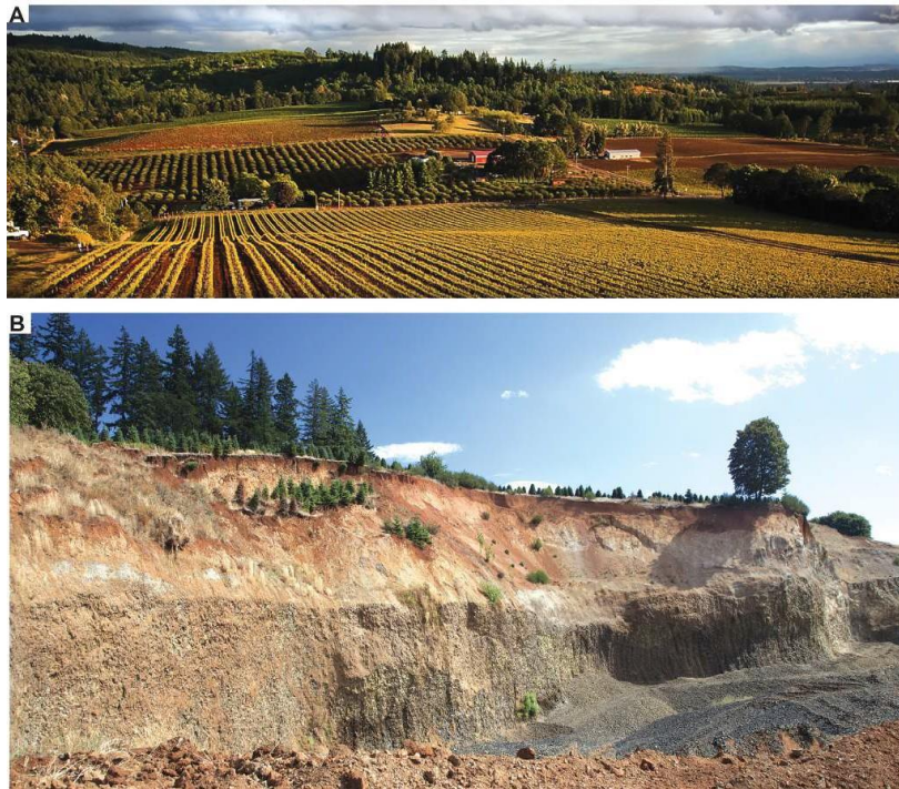
Figure 2: Red Jory Ultisol of Willamette Estate Vineyards in the south Salem Hills, Oregon, USA, where it is developed atop a thick middle-Miocene Oxisol (lateritic bauxite), red in the vineyards (A), and thick in a nearby quarry (B). The Jory soil series is intensely planted in vines, but comes in two distinct varieties parented by bauxite or by basalt.