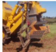
A delve plough

Soils that restrict proper grapevine root development together with the high cost of establishing a new vineyard, require effective soil preparation to sustain productive vineyards for 25 years. This study reviews soil preparation research conducted over the past 50 years which are combined in a book format and identifies best practices to remove soil physical and chemical impediments to create optimum conditions for root growth.