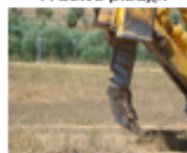
A ripper plough